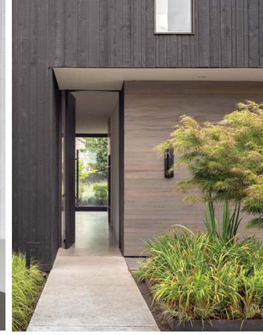
ABOVE LEFT The primary bathroom is made serene with white ceramic tile, floating tub, and a curbless shower with skylight. TOP RIGHT In the art room, the casework by Winterwood Custom Cabinetry syncs with the rest of the house. BOTTOM RIGHT The house's design "lets the landscape come forward as the main visual element," says Wittman. The entry pivot door is by Quantum. BOTTOM LEFT The primary vanity combines an oak base with a concrete basin and inset teak shelf.

PortraitMagazine.com PortraitMagazine.com